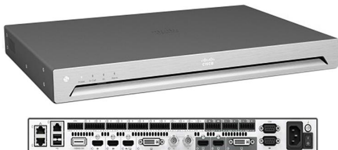
Figure 1. Cisco TelePresence SX80 Codec

Cisco offers three SX80 Integrator Packages to reduce the need for external equipment and the overall cost of enabling video in larger meeting rooms: