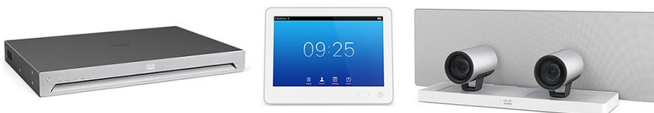
Figure 2. Cisco TelePresence SX80 Integrator Package with Touch 10 and SpeakerTrack 60

With its powerful media engine, the SX80 Codec lets you build the video collaboration room of your dreams.