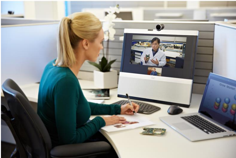
Figure 3. Cisco TelePresence EX60 in Ad-hoc Conference Call